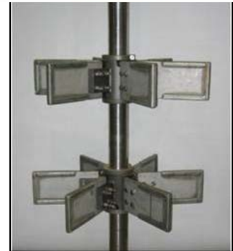
McKay 48 Hard Facing Weld Overlay on Blade Edges for Abrasion Protection